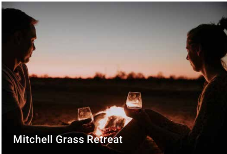
Mitchell Grass Retreat