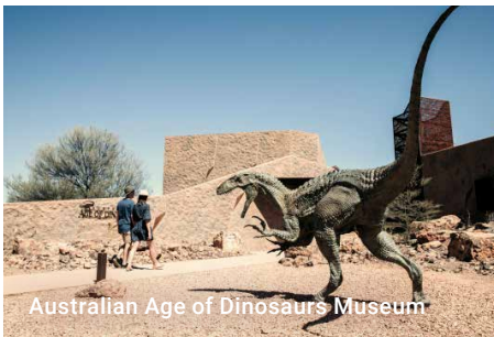
Australian Age of Dinosaurs Museum

boulder opal, and revel in the vastness of Quilpie – certainly one of the best places to visit in Queensland's vast outback. B L DW