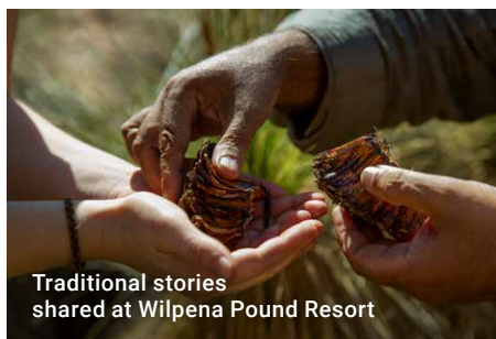
Traditional stories shared at Wilpena Pound Resort