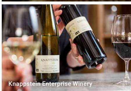
Knappstein Enterprise Winery