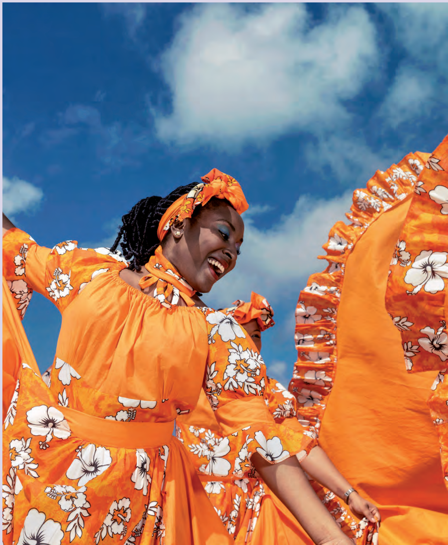
Traditional Caribbean dancer